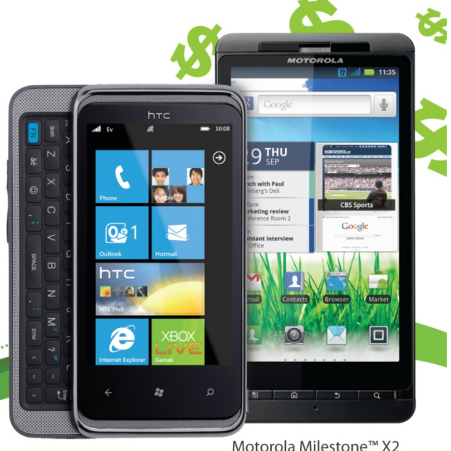
HTC 7 PRO™